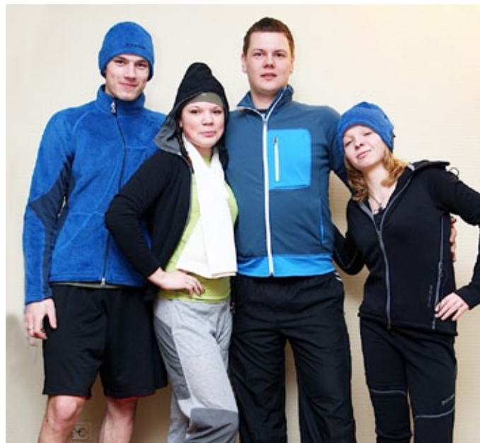
Here four happy students pose in really nice sports clothing that Houdini Sportswear donated to the school. A much appreciated gift.