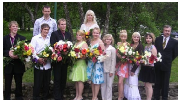
The graduates of 2007

Fifteen years later, the school has had nearly 300 students. 80% of those who leave school lead secure lives with work or further studies. The school has developed its own methods where social rehabilitation has a large place together with four vocational programs, English, training in how to use computers and practical life skills. There is now a growing interest in Livlust's methods among others working with children at risk.