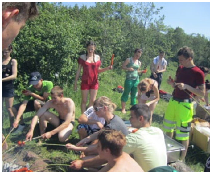
This year's anti-smoking day was as usual spent in nature with hiking and barbecue.

New on the board of Dzivesprieks in Latvia is Edgars Zalans, former Minister of Municipalities in the Latvian Government.