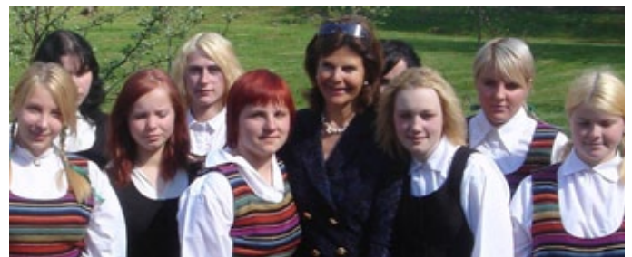
The Queen came back to the 10th anniversary in 2006 and celebrated together with the students.

Fifteen years later, the school has had nearly 300 students. 80% of those who leave school lead secure lives with work or further studies. The school has developed its own methods where social rehabilitation has a large place together with four vocational programs, English, training in how to use computers and practical life skills. There is now a growing interest in Livlust's methods among others working with children at risk.